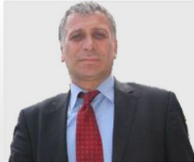
Çatalağzi Belediye Başkanı Adnan AKGÜN